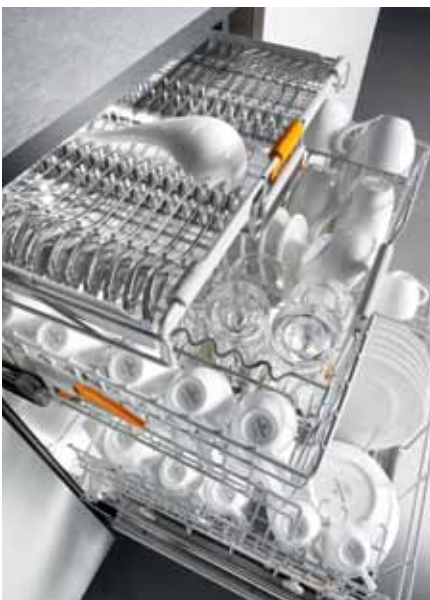
FlexiCare Deluxe basket design