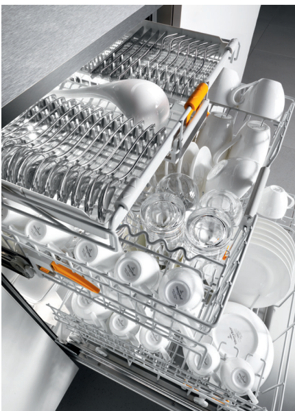
FlexiCare Deluxe basket design