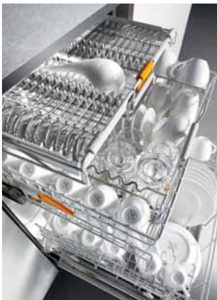
FlexiCare Deluxe basket design